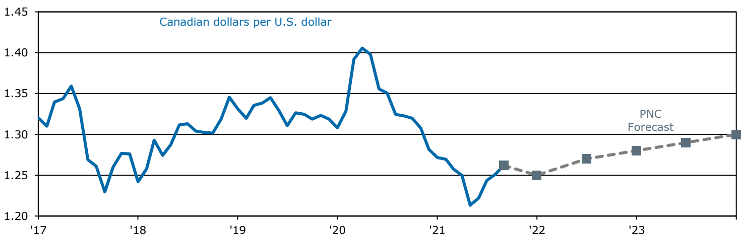
CHART 3: LOONIE TO GAIN GROUND BY YEAR-END, THEN EDGE LOWER AS THE FED TAPERS AND ENERGY PRICES STABILIZE