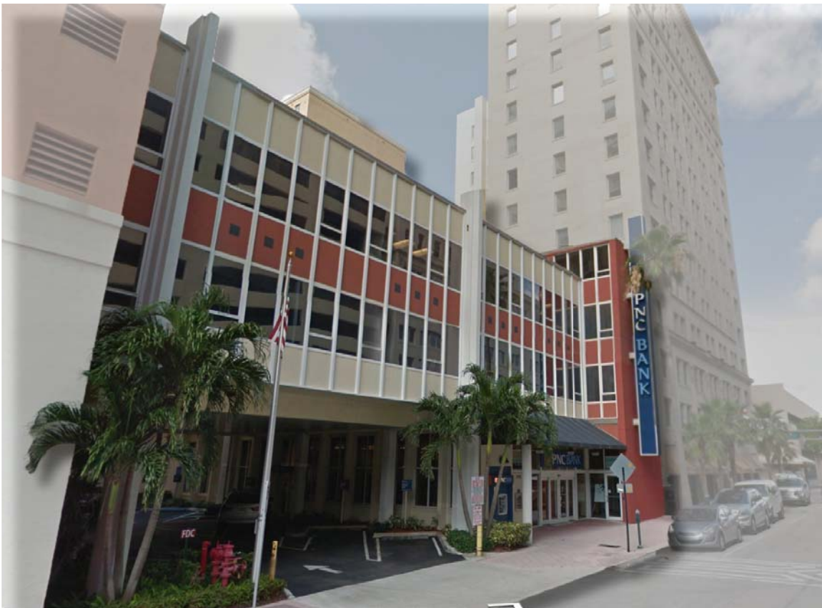
* 218 Datura Street Office - West Palm Beach, FL- Page 5